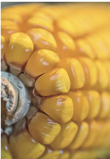
Healthy kernels are another benefit of Bt hybrids against ear-feeding Lepidopteran species.

“Let someone—your university Extension staff, your crop consultant, your seed company representative, for example—know when you have an unanticipated insect problem in your Bt corn,” she says. If caught in time, researchers ▶