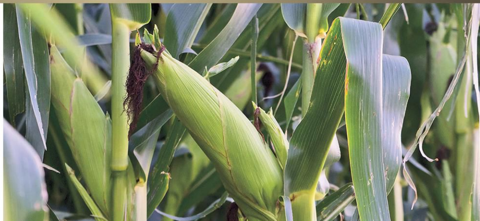
Hybrids containing Bt proteins provide protection against corn borer, corn rootworm and various ear-feeding caterpillars to prevent lodging and ear drop.

Those approaches provide a wide variety of choices for corn growers, but they also can create